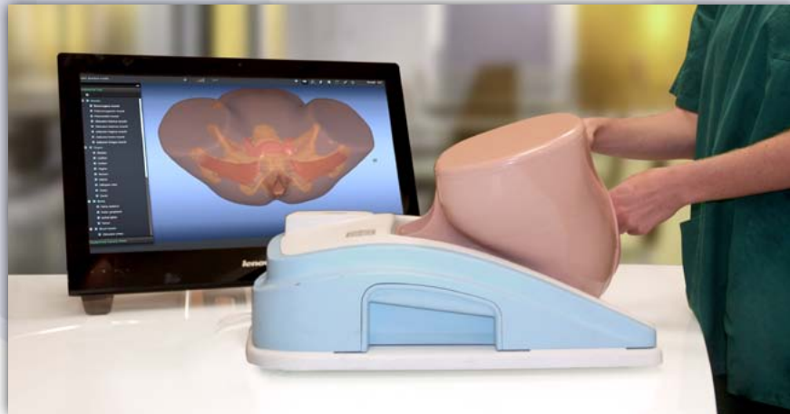
Mannequin palpation synchronized with model on screen

The PELVIC Mentor is a strong didactic tool that provides trainees with immediate feedback on anatomical recognition and trainers with the ability to track the learner's performance.